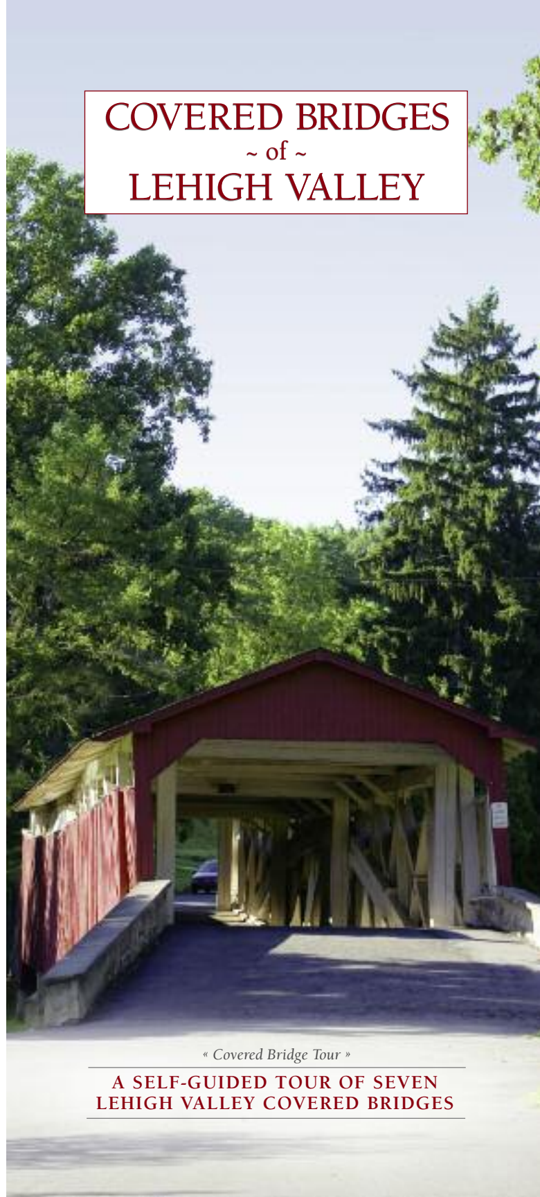
« Covered Bridge Tour »